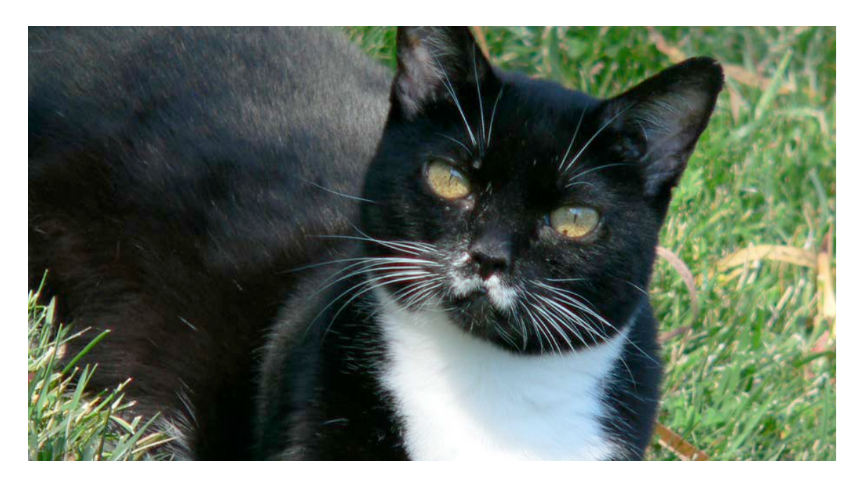
Our fifth cat Lucy adopted us by showing up one night and moving right into our house.