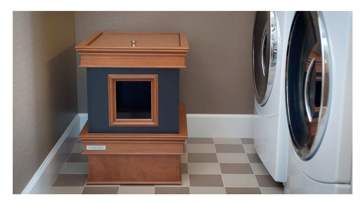
Our Litter Cabinet in Premium Honey with Estate Black accent paint.