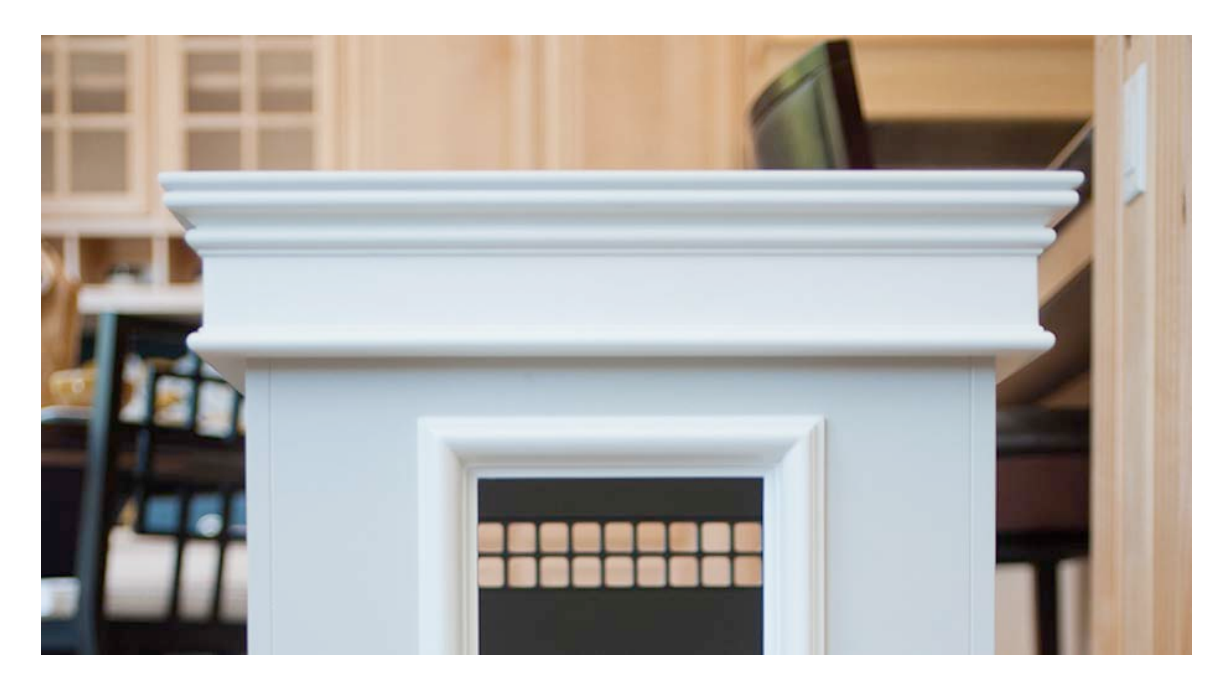
Our Litter Cabinet has a vent in the back to ensure air circulation for cats.