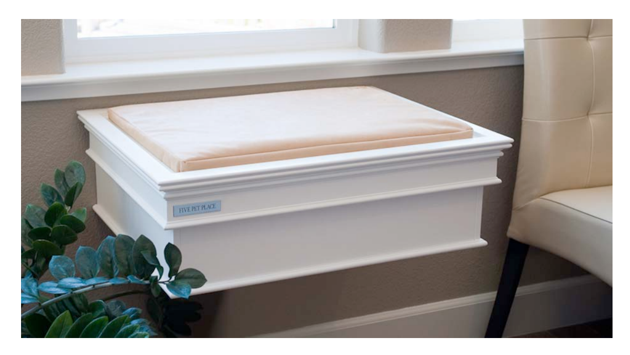
Our Window Bed with Cottage Tan cushion and optional electronic heating system.