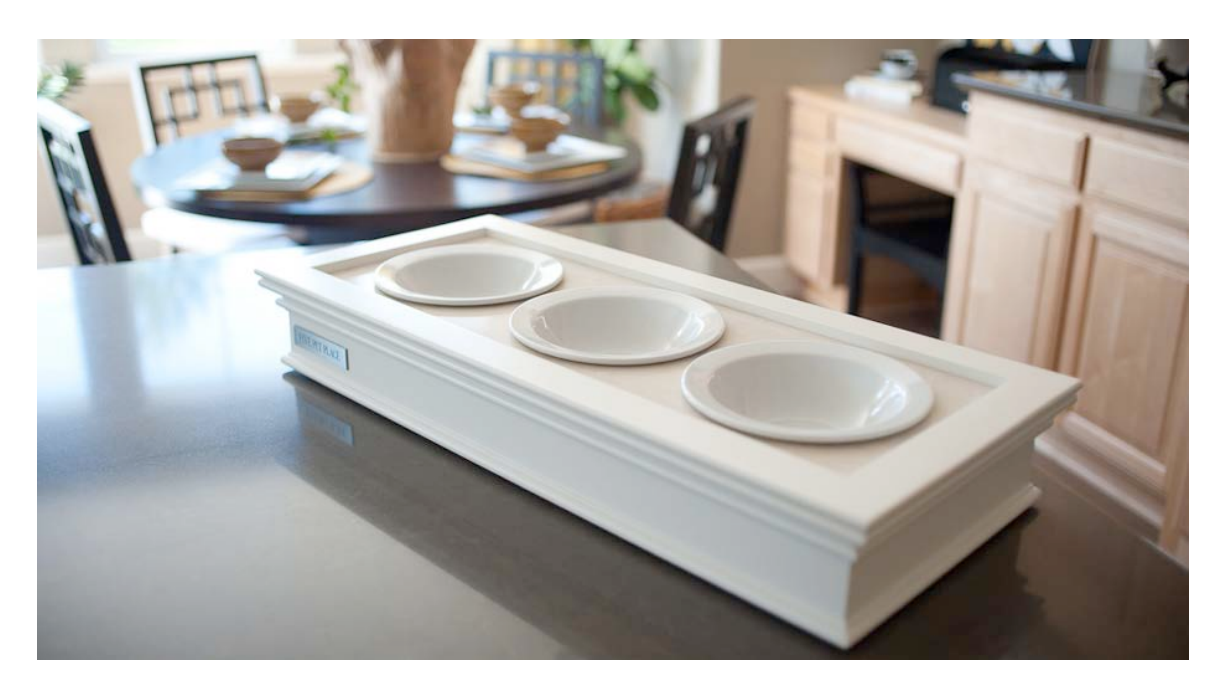
Our three bowl Food & Water Server in Pure White with Crema Marfil Quartz centerpiece.