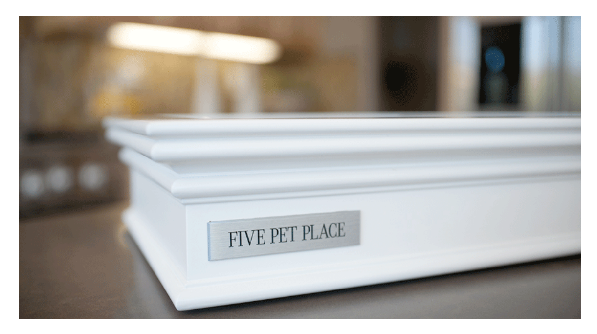
Our products may be grouped together or strategically placed throughout a home.