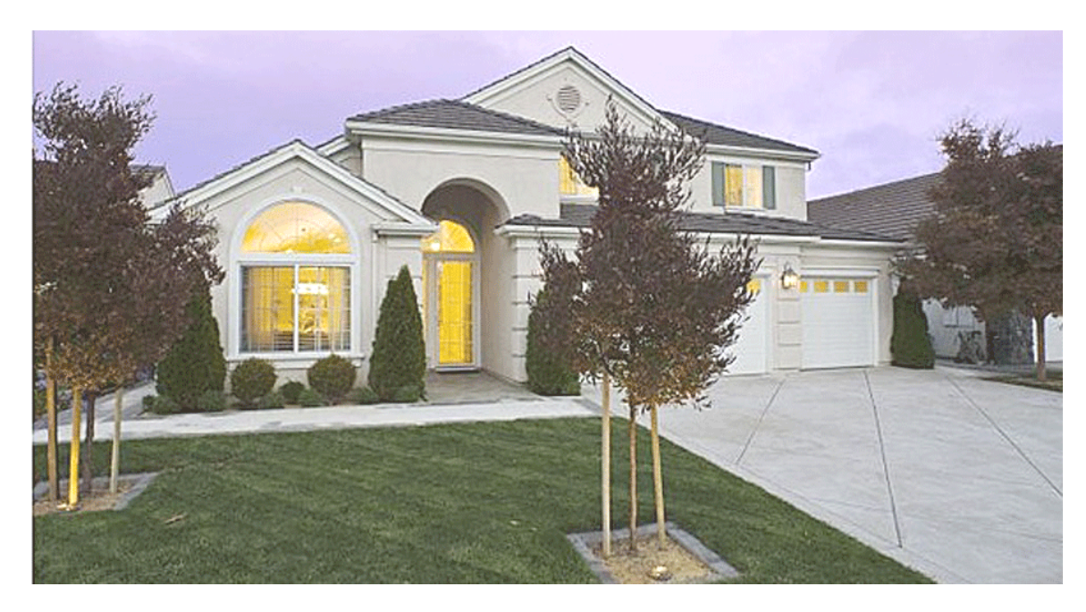
The house that became the loving home known as Five Pet Place.