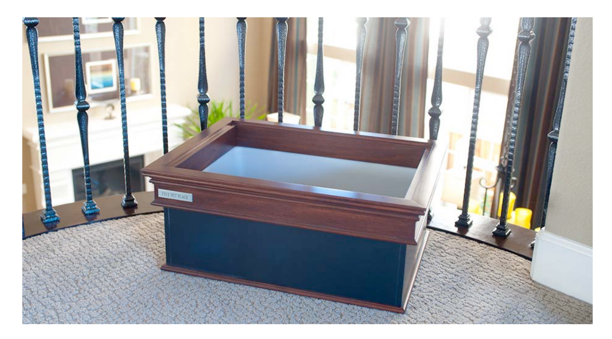
Our Litter Tray in Select Walnut with Estate Black accent paint.