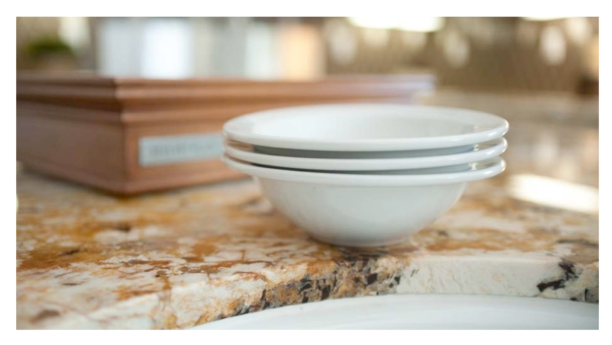
Our Food & Water Server uses high-quality dinnerware made exclusively for restaurants.