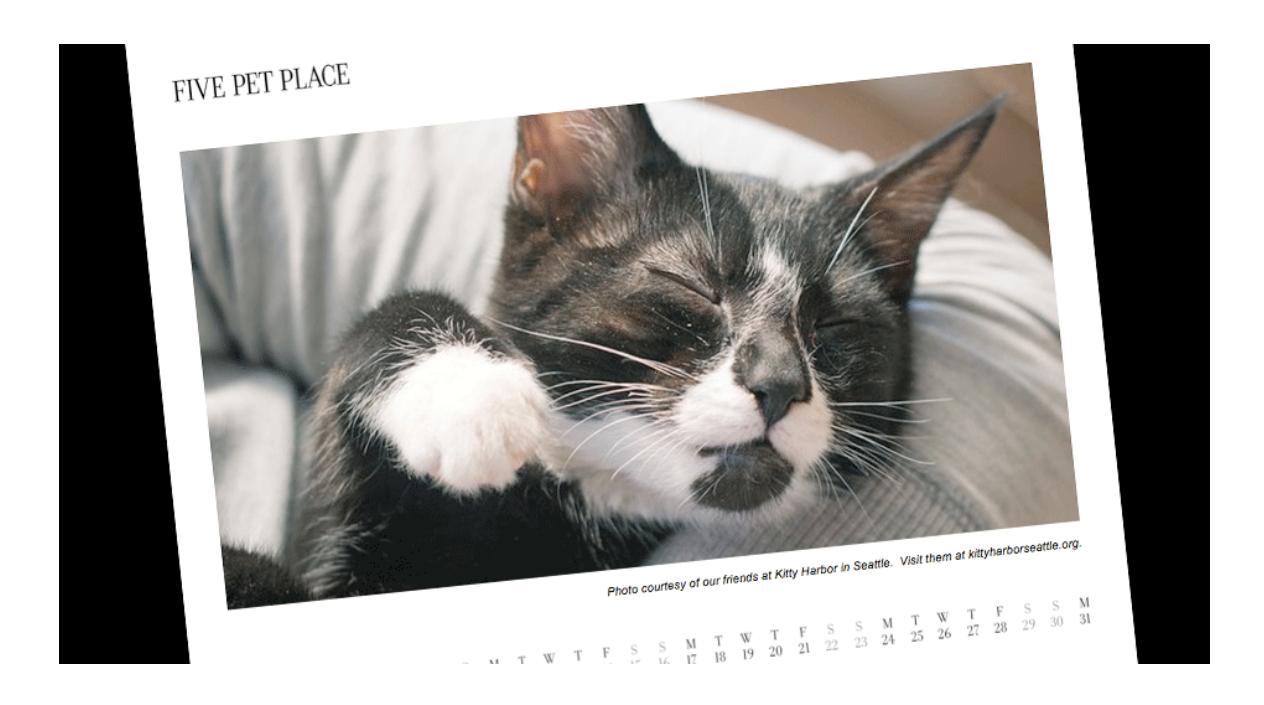
While the Five Pet Place Calendar might be free – it's rich with style.