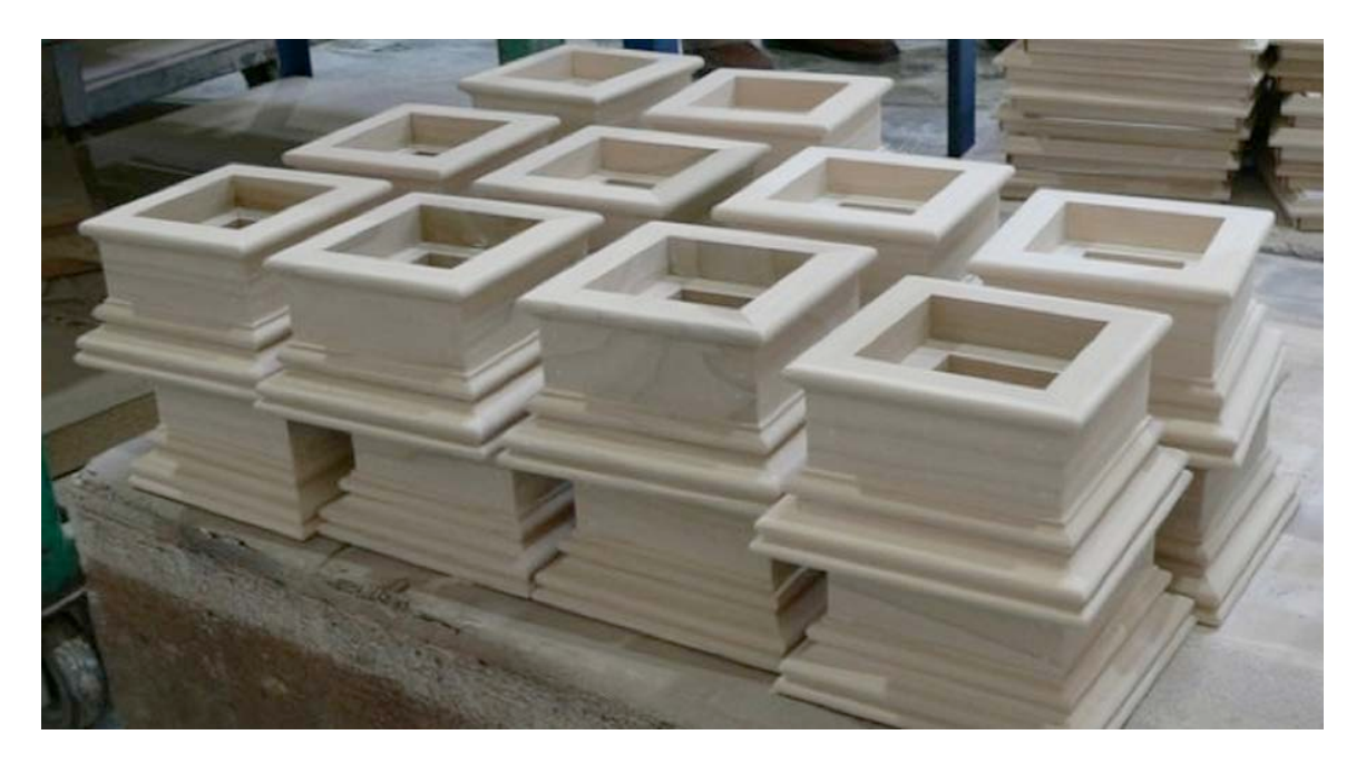
The wood for these Scratching Post Insert caps comes from continuously replanted forests.

Are we perfect? No. Are we doing the best we can and looking for ways to do even better? Yes. Are we better than our competitors? As far as we know, yes.