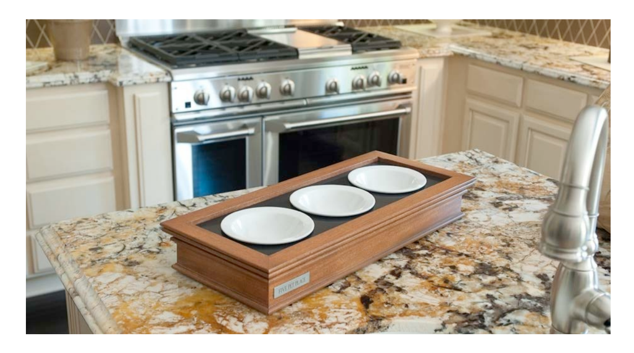
Our three bowl Food & Water Server in Premium Honey with Absolute Black Quartz centerpiece.