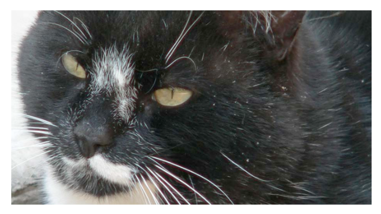
Paint thinks of his Five Pet Place Scratching Pad as a perch to hang out on all day.