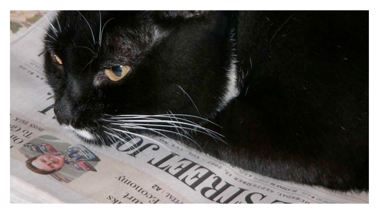
While Lucy likes newspapers, she really loves her Five Pet Place Window Bed.