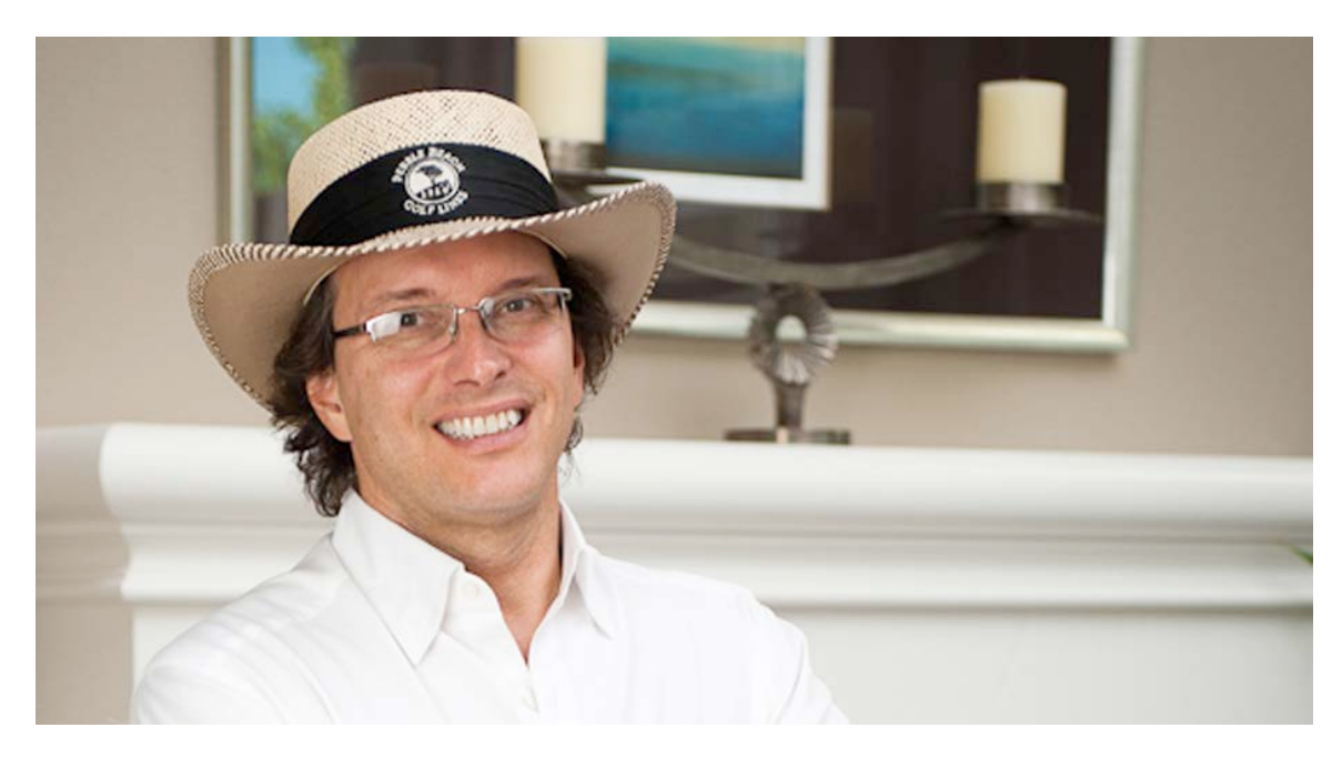
As recorded during the Pebble Beach Concours d'Elegance August, 2011.