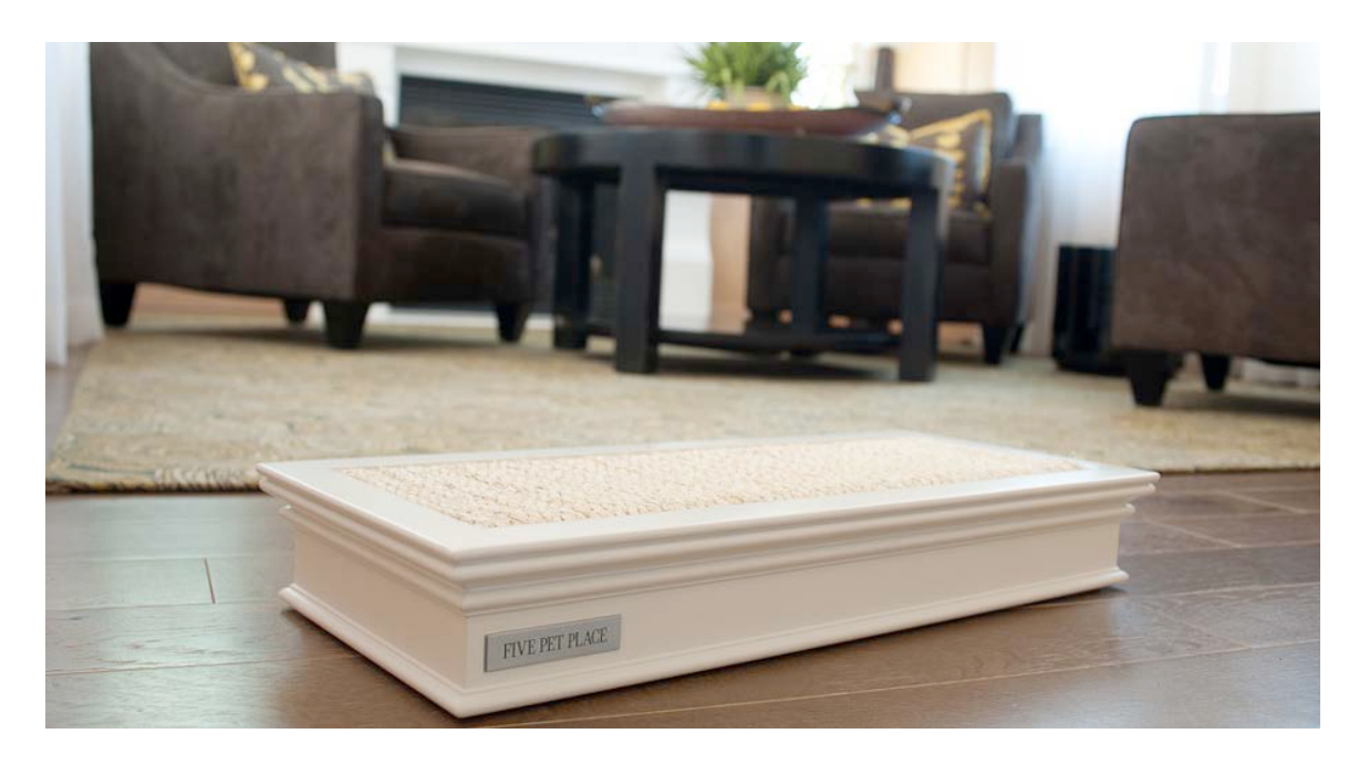
Our Scratching Pad with natural sisal rope insert and Pure White frame.