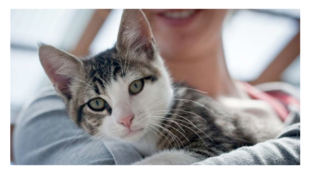
Five Pet Place wouldn't exist if we didn't love cats.