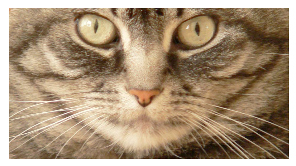
Sabrina works out on her Five Pet Place Scratching Post first thing every morning.