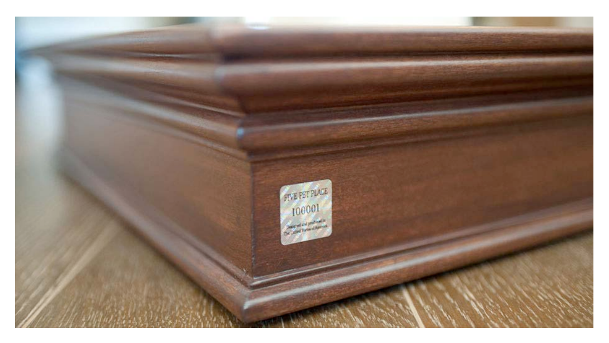
Five Pet Place products have individually registered serial numbers to certify their authenticity.