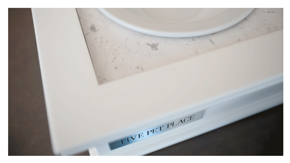
Prima Carrara guartz is an available accent on our Food & Water Server and Scratching Post.