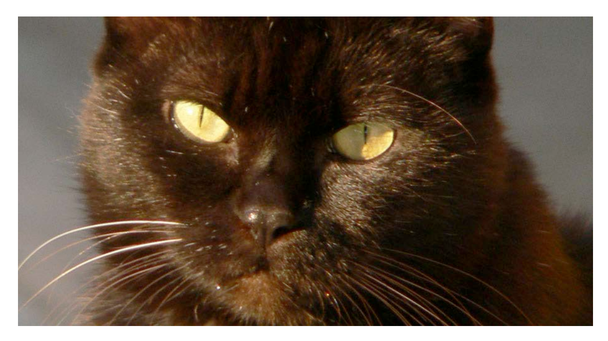
Napa loved her Five Pet Place Food & Water Server, Litter Tray and Scratching Pad.