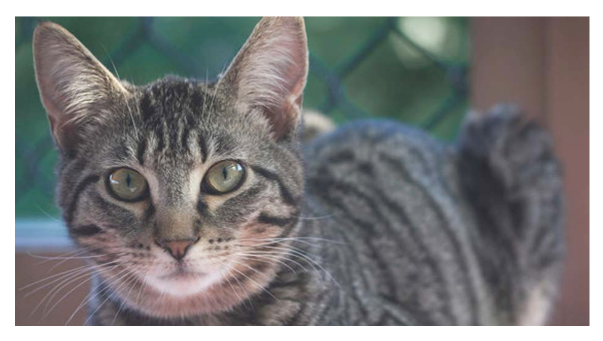
Our philanthropy efforts are designed to help non-profits like Seattle's Kitty Harbor.