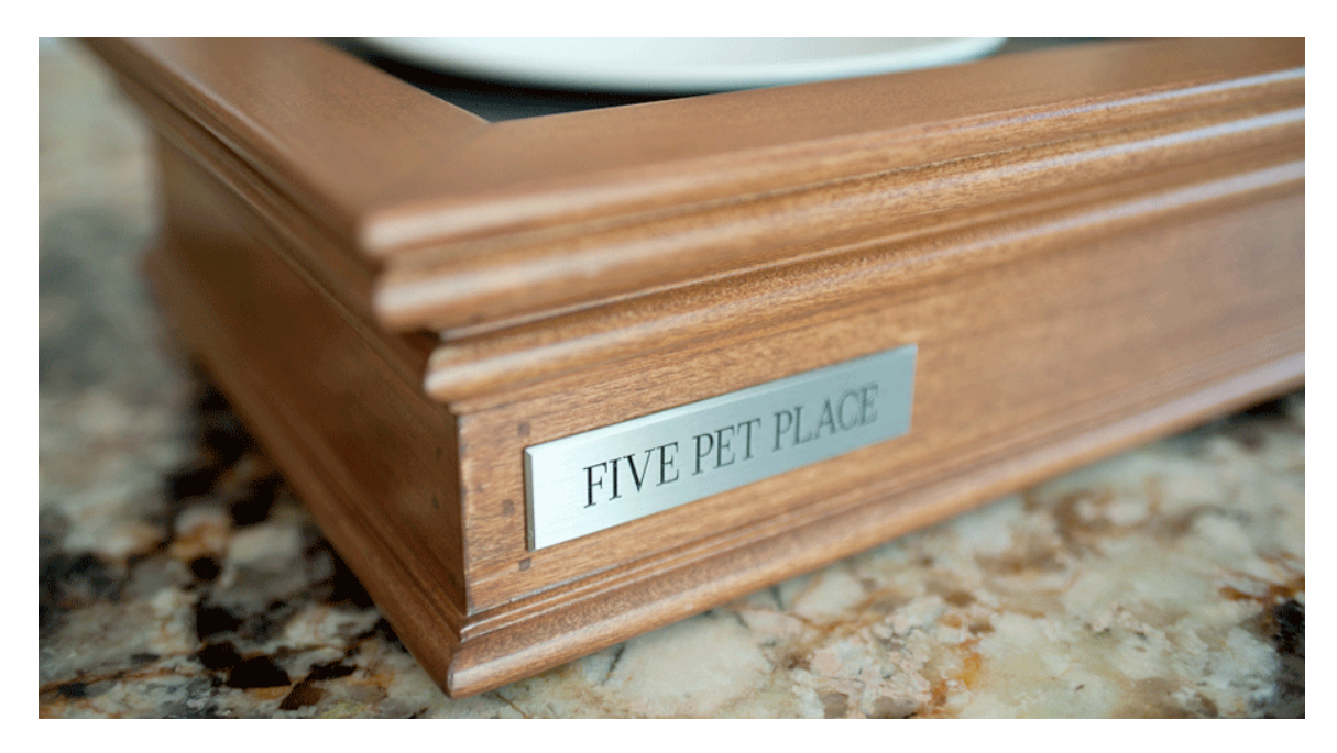
We proudly display our name via deeply etched metal nameplates from a factory in Ohio.