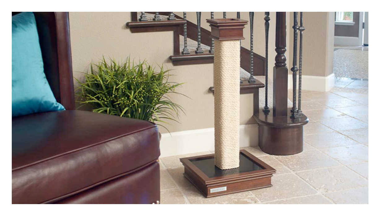
Our first Scratching Post, serial number 100001, was sent to Mikhail Gorbachev.