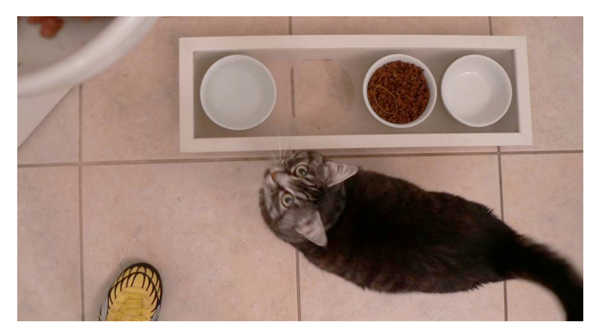
Here's our Sabrina waiting for breakfast to be placed in one of our early Food & Water Servers.